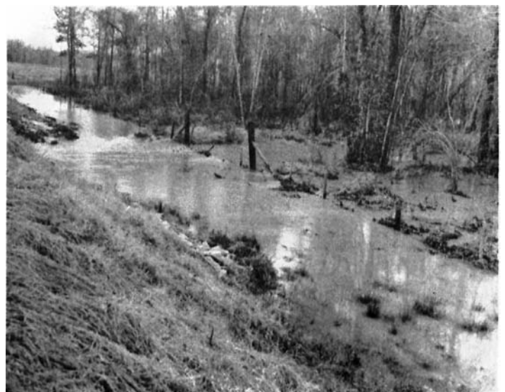
Figure 11.—Low-grade hardwoods occupy large areas of soils in woodland suitability group 9.

The average site index is 88 for loblolly pine and 79 for shortleaf pine. Excess moisture promotes severe plant competition (fig. 11), which must be controlled before a desirable stand can be established. Equipment limitations are severe following long periods of rainfall. Also because