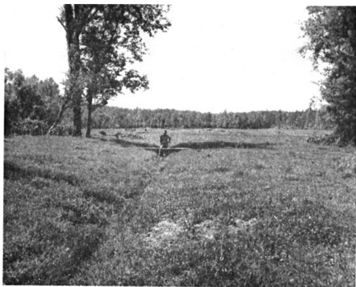
Figure 6.—Tall fescue and white clover established on drained soil in capability unit IIIw-2.

Row crops are only fairly well suited to this soil. Corn and sorghum, as well as vegetables and other truck crops are suited, but cotton, small grain, serica lespedeza, and alfalfa are not. Suitable plants for pasture and hay are