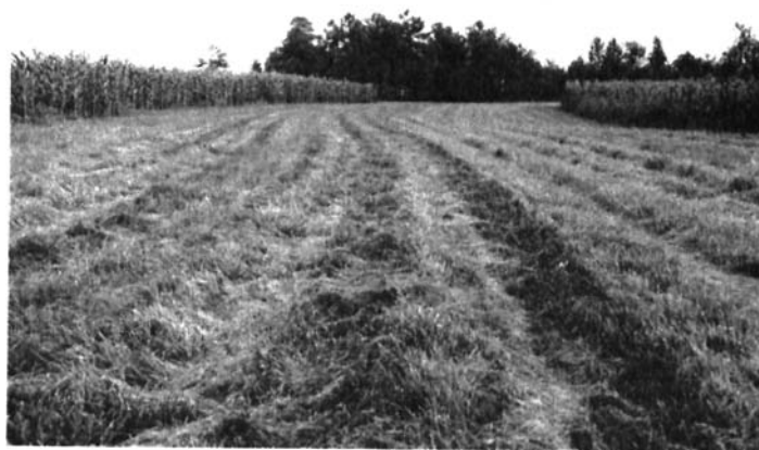
Figure 5.—Corn and tall fescue in parallel strip rotation on Lloyd clay loam, 2 to 6 percent slopes, severely eroded, in capability unit IIIe-1.

Most of the acreage is low in natural fertility, contains little organic matter, and is strongly acid. The movement of water into and through these soils is moderate to