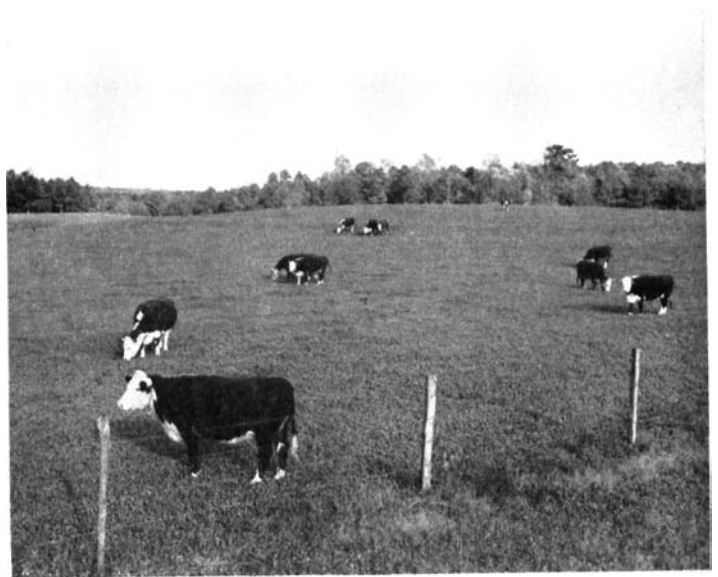
Figure 3.—Tall fescue and ladino clover on soils in capability unit IIe-1 in foreground. The more strongly sloping soil in the background is in capability unit IIIe-1.

Annual applications of phosphate and potash are required to maintain high yields of most crops, and in addition, nitrogen is required for nonlegumes. Some crops, especially legumes, respond to the addition of lime. Turning under an occasional cover crop and residue from row crops helps maintain a fairly adequate amount of organic matter.