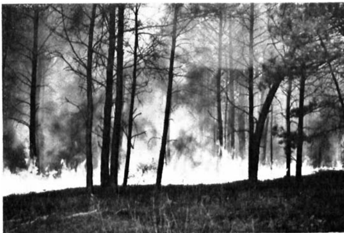
Figure 12.—Wildfire in a pine forest.

Wildlife is dependent upon the soil, water, and plant resources of an area. The largest populations of fish, wild animals, and birds are generally in areas of the more productive soils. Wildlife is often abundant, however, on wet soils and on some other soils that normally are