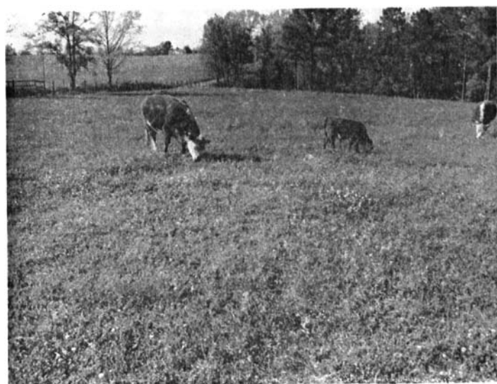
Figure 7.—Tall fescue and white clover on soils in capability unit IVe-1.

Annual applications of phosphate and potash are required to maintain high yields of most crops, and in addition, nitrogen is required for nonlegumes. Some crops, especially legumes, respond to the addition of lime. If these soils are cultivated, runoff is the chief hazard. Erosion can be controlled by (1) tilling on the contour, (2) stripcropping, (3) using a perennial crop in the cropping system, (4) terracing, and (5) establishing grassed waterways.