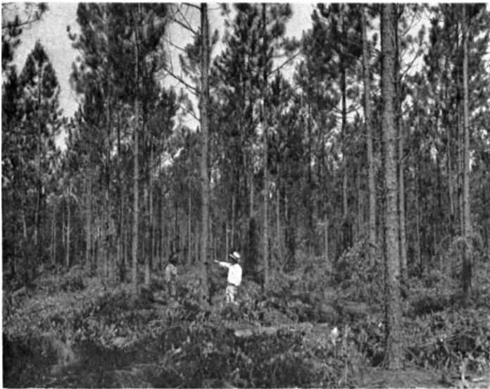
Figure 9.—A well-managed, 15-year-old stand of loblolly pine on soil in woodland suitability group 2.

The soils of this group have few woodland management problems that are specifically related to soil characteristics. The average site index is 82 for loblolly pine (fig. 9) and 71 for short leaf pine.