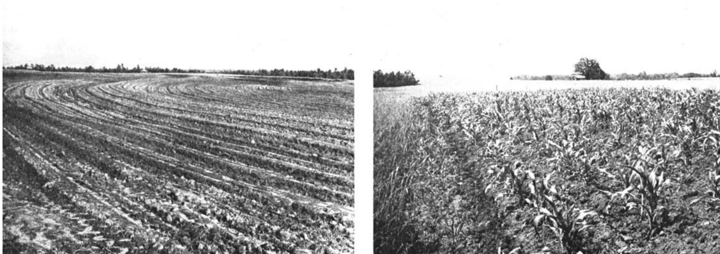
Figure 4.—Soils in capability unit IIe-1. Left , soil plowed and planted on the contour. Right , corn and tall fescue in a parallel strip rotation on Lloyd sandy loam, 2 to 6 percent slopes, eroded.