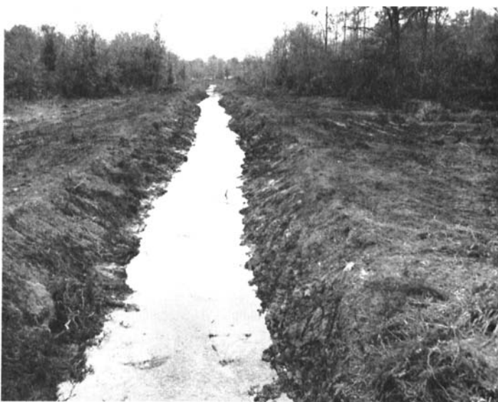
Figure 8.—Channel excavation in soil of capability unit IVw-1.

The surface layer is sandy loam that overlies grayish-brown to light yellowish-brown, mottled silty clay loam or sandy clay loam. Plant roots can penetrate to a depth of 5 to 20 inches. Depth to bedrock exceeds 10 feet in most places.