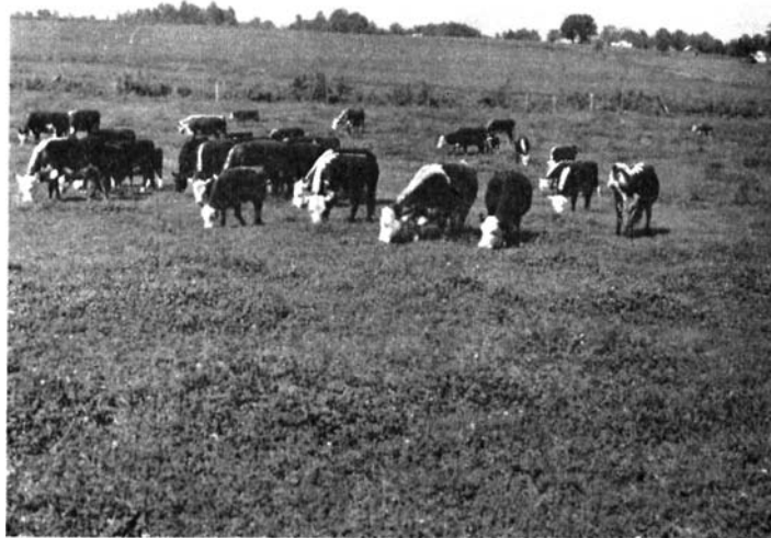
Figure 2.—Pastures have been improved on many farms in the Cecil-Madison soil association. These beef cattle are grazing bermudagrass, dallisgrass, and ladino clover.

Agriculturally, the soils in this association are the most important in the county. Nearly all of the farms are owner operated and are of about average size for the county or larger. Most of them are grain-livestock farms (fig. 2), but a few produce only peaches or other specialized crops.