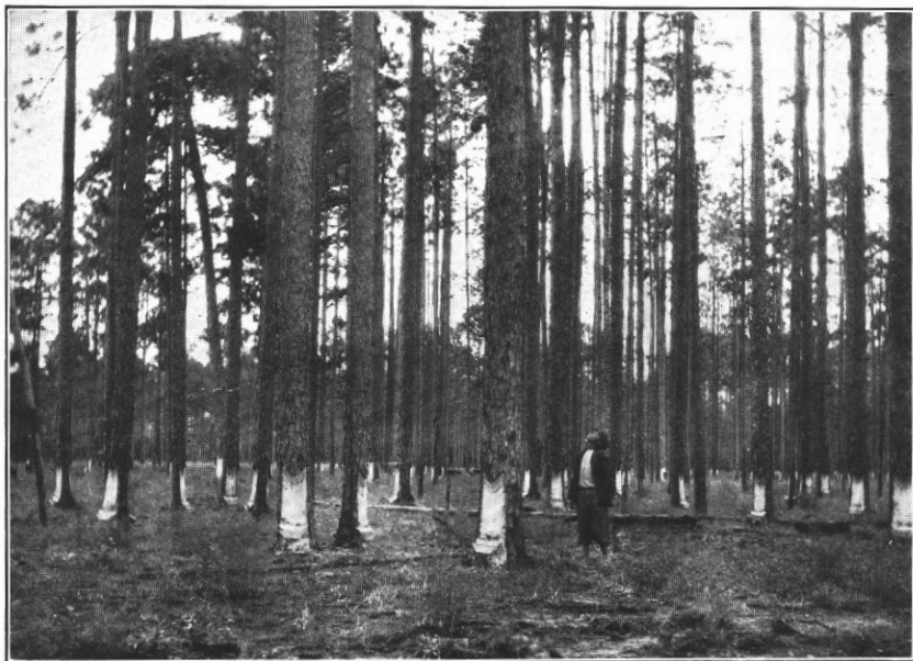
FIG. 2.—CHARACTERISTIC GROWTH OF LONGLEAF (YELLOW) PINE, "BOXED" FOR TURPENTINE, ON SCRANTON SANDY LOAM, NEAR LEW.