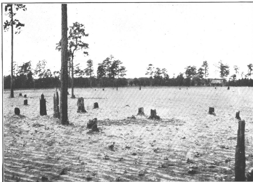
FIG. 1.—CHARACTERISTIC SMOOTH SURFACE OF THE TIFTON SANDY LOAM. [The crest of a ridge south of Claxton.]