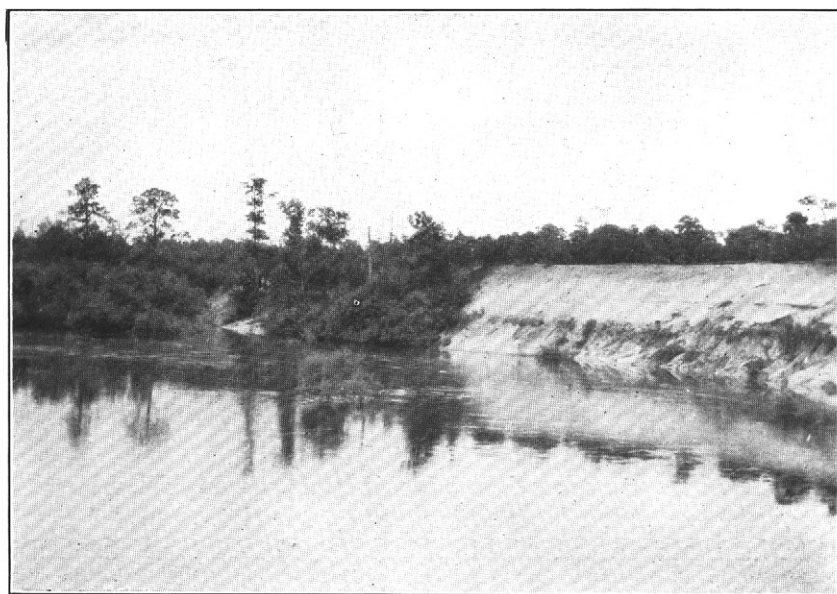
FIG. 2.—SAND BLUFF ON EAST SIDE OF OHOOPEE RIVER WEST OF GLENNVILLE.