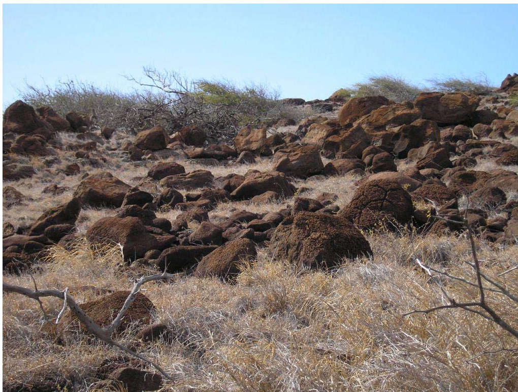
Figure 5.—An area of Rock outcrop-Lithic Torriorthents complex, 30 to 50 percent slopes (map unit 25).

Frequency of ponding: None Available water capacity: Very low (about 0 inches)