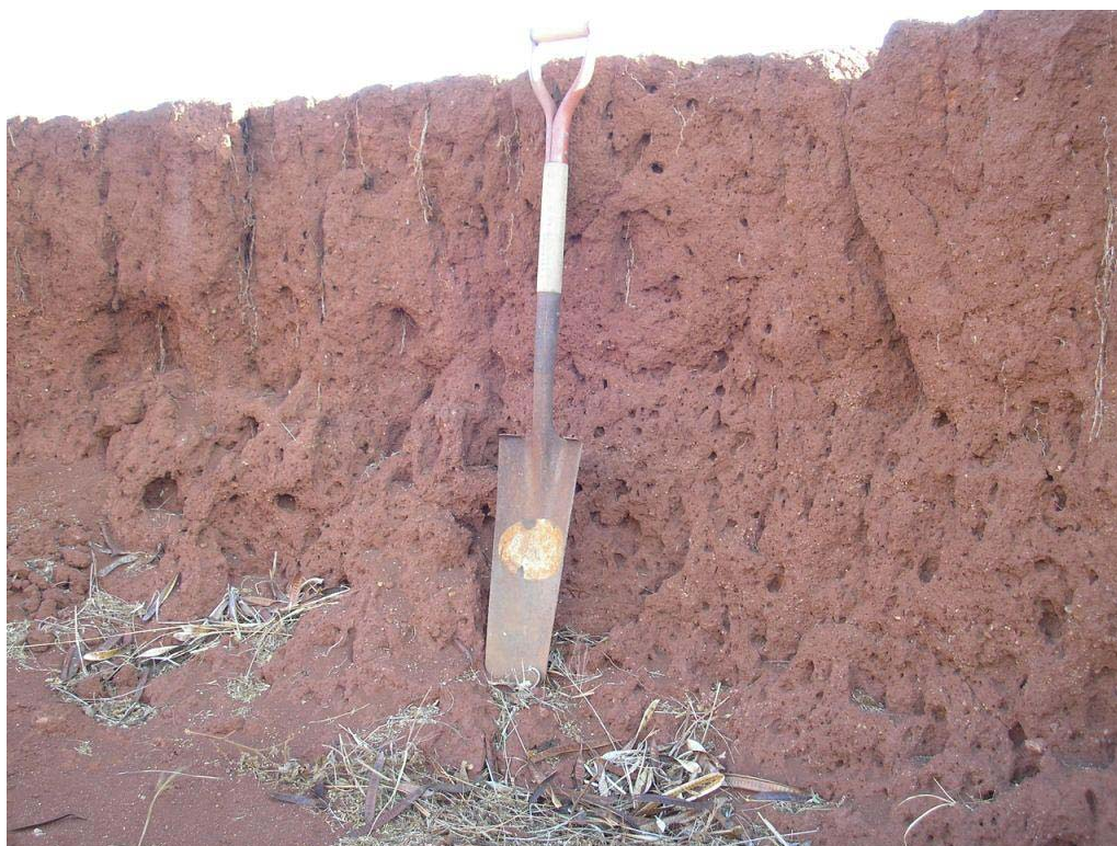
Figure 6.—An area of Typic Haplotorrox, dark surface, 3 to 8 percent slopes, severely eroded.