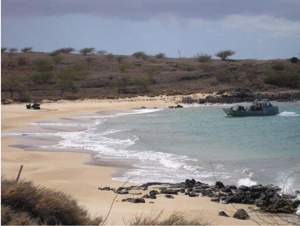
Figure 2.—An area of Beaches, 0 to 5 percent slopes (map unit 4) and Typic Haplotorrerts, extremely stony, 3 to 15 percent slopes (map unit 12).

Lua Makika, in the eastern part of the island. The island is not inhabited; however, there is a small base camp at Hanakanaea (Smuggler's Cove) in the southwestern part of the island (fig. 2). There are no perennial streams.