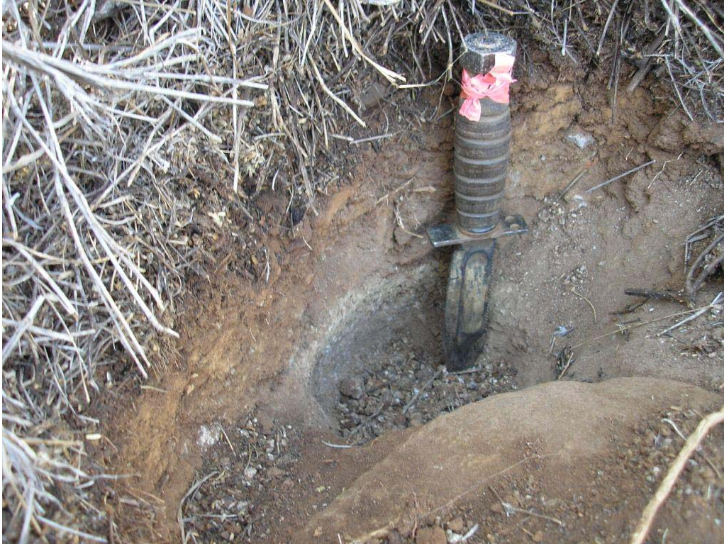
Figure 4.—An area of Lithic Torriorthents.