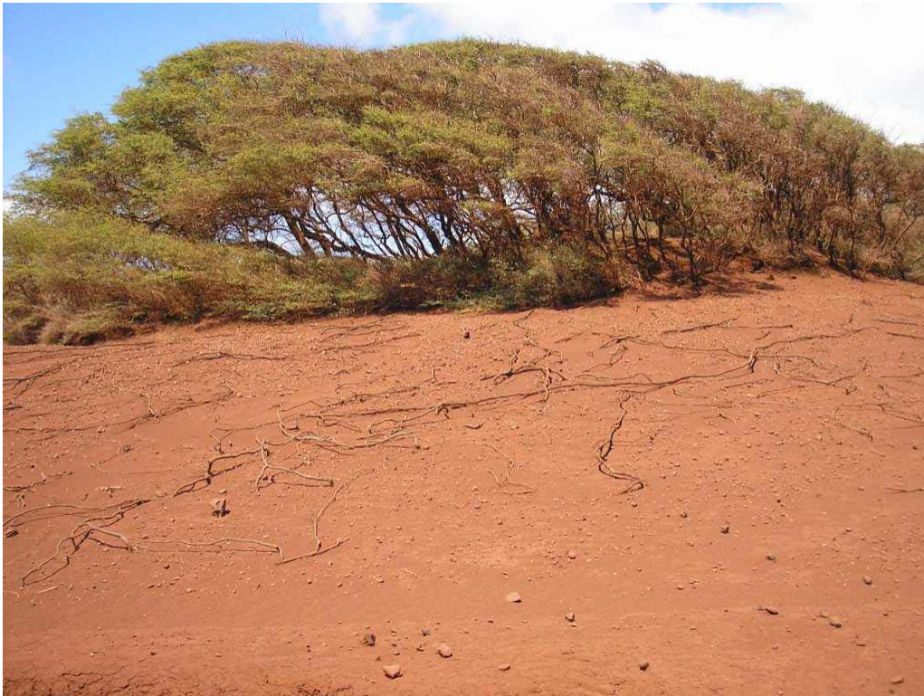
Figure 3.—An area of Typic Haplotorrox, windblown, 3 to 8 percent slopes, hummocky (map unit 19). The island is windswept, and large areas are bare of vegetation.

Currently, soils are mapped according to the boundaries of major land resource areas (MLRAs). MLRAs are geographically associated land resource units that share common characteristics related to physiography, geology, climate, water resources, soils, biological resources, and land uses (USDA, 2006). Soil survey areas typically consist of parts of one or more MLRA.