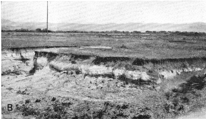
A, Profile of soils of the Hyrum series, showing gravelly subsoils with gray layer of lime accumulation; B, profile of Bear Lake soils in Bear Lake flat west of Dingle