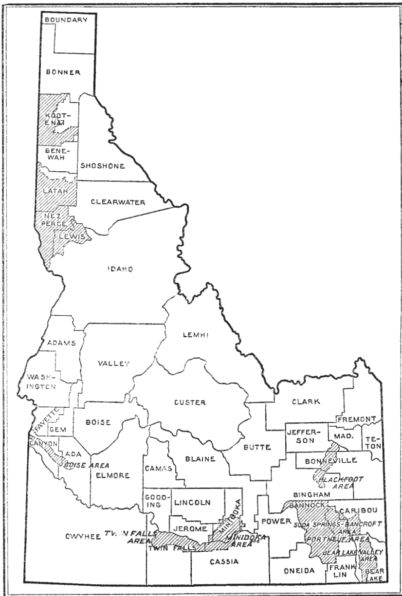
Areas surveyed in Idaho, shown by shading