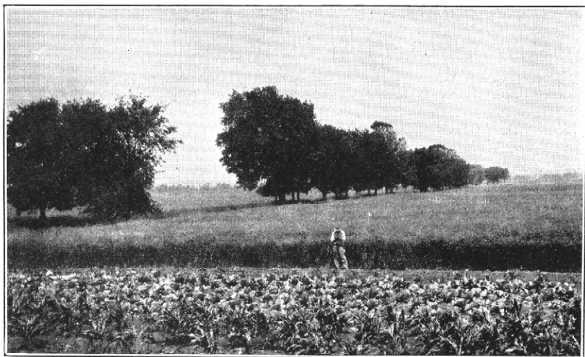
FIG. 1.—FIELD OF WHEAT ON THE LINTONIA SILT LOAM.