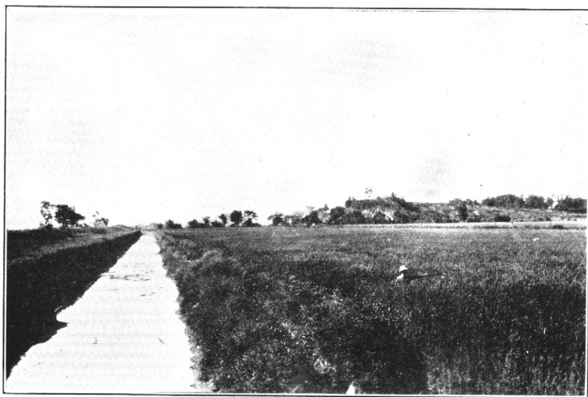
FIG. 2.—DRAINAGE DITCH THROUGH THE WABASH SILT LOAM.

Note the splendid growth of wheat in the adjacent field.