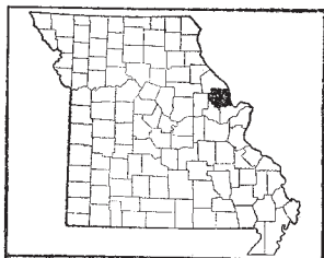
FIG. 1.—Sketch map showing location of the Lincoln County area, Missouri.

The flood plain of the Mississippi River has an elevation above sea level of slightly less than 450 feet, and consequently lies 250 to 350