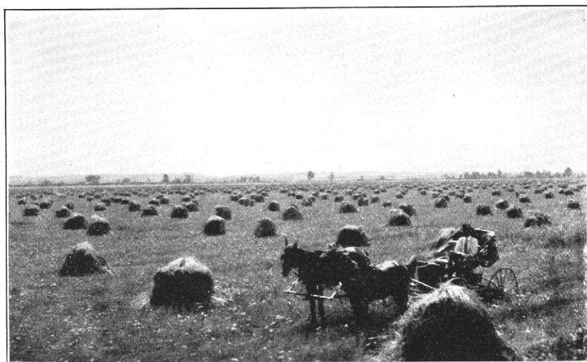
FIG. 2.—FIELD OF WHEAT ON WELL-DRAINED WABASH SOILS.