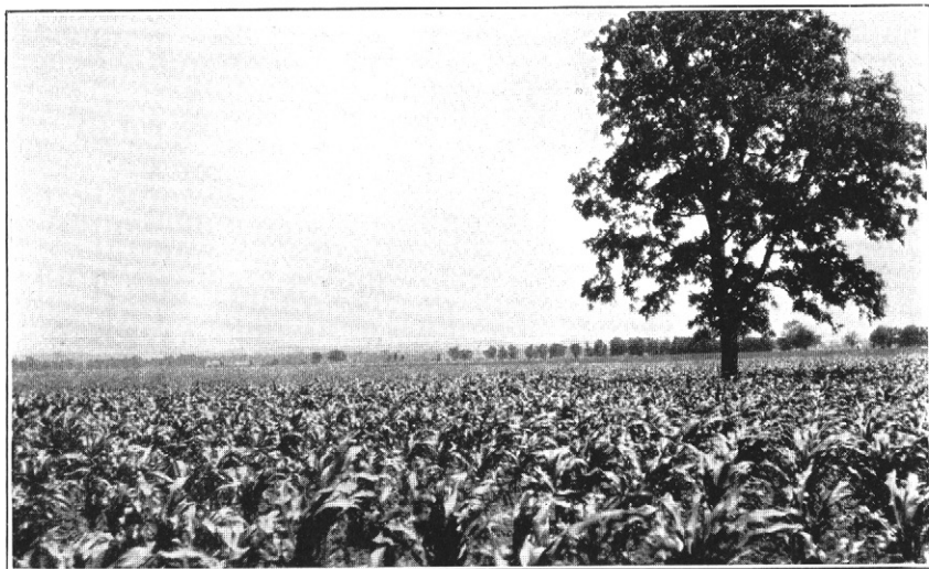
FIG. 1.—CORN ON ARTIFICIALLY DRAINED WABASH CLAY LOAM.