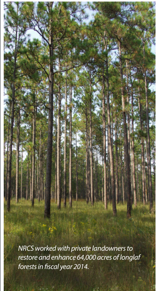
NRCS worked with private landowners to restore and enhance 64,000 acres of longleaf forests in fiscal year 2014.

In partnership with the National Fish and Wildlife Foundation, NRCS contributed to the Longleaf Stewardship Fund, awarding 15 grants totaling $3.8 million for projects in the longleaf pine range that will restore 11,800 acres and improve more than 116,000 acres of longleaf pine habitat.